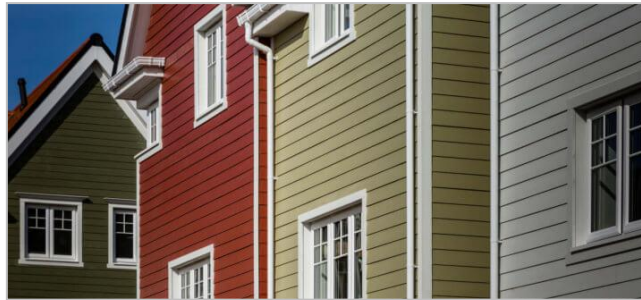
FIGURE 1: HARDIEPLANK® IN USE

This EPD applies to three painted fibre-cement panel products used for external cladding of buildings: HardiePanel®, HardiePlank® and HardieLinea® (pictures below). The products are supplied as panels (boards) of standard dimensions. These products have been engineered for maximum longevity in the European climate, and withstand a diverse range of weather conditions such as wind, rain, hail, snow and sun. They are also resistant to mould, decay, pests and rot.